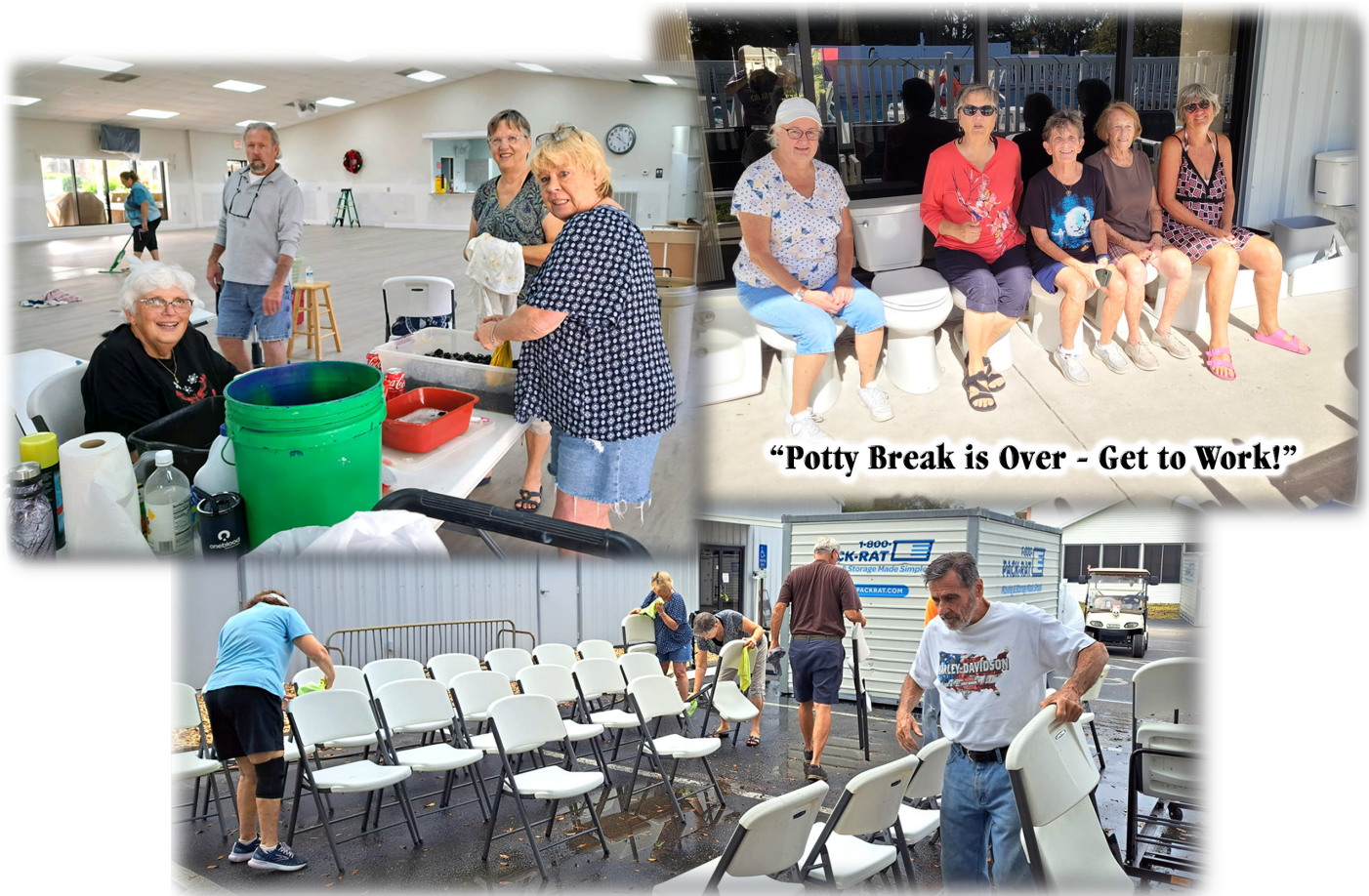
"Potty Break is Over - Get to Work!"

The heart of any vibrant community is its people, and the recent transformation of our Challenger Clubhouse is a shining example of this. In the first morning hours of October 10th, after seeing the devastation caused by Hurricane Milton, volunteers quickly joined together to dry out the building and salvage what they could and tore out all of the carpeting, drywall, and cabinets that needed to be disposed of. The furniture was all washed and disinfected and placed inside pods, as was a multitude of items stored in closets and cabinets. Building and Grounds Committee Chairman Sam Harris and Dan Baumer acting as project manager, with the advice of the Adjuster, worked long hours supervising all of this preliminary work.